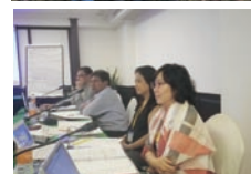
Photos show the ANNE discussion process from 2006 to 2012.