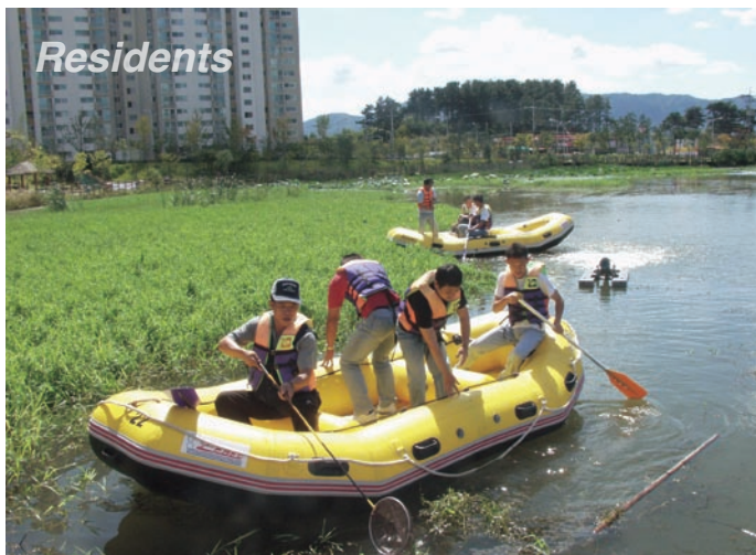
NGO working for sustainable local community development 2 Saving city swamps & eco lake building project. Jeonju Council for Local Agenda 21, Jeollabuk-do, Republic of Korea

The solution against unsustainable patterns in Asia is essential in achieving sustainable development of the world.