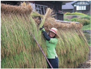
NGO working for sustainable local community development 4 Connecting cities and rural villages - beyond depopulation and urbanization Green Earth Center (GEC), all areas of Japan