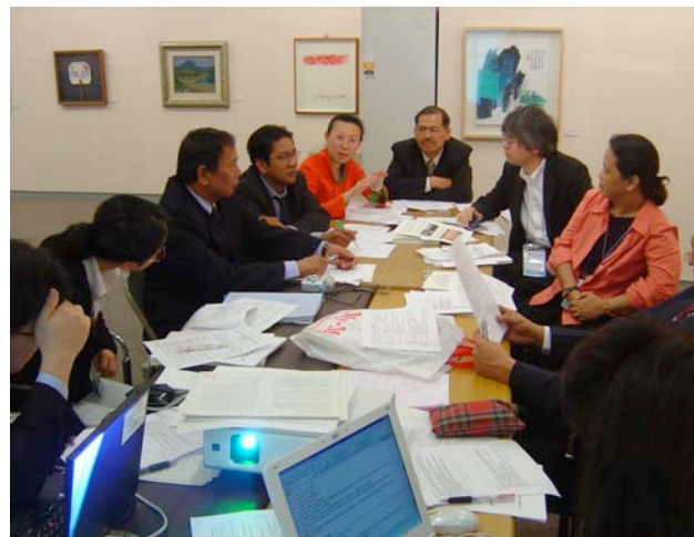
Discussion session of AGEPP in Tongyeong, Korea on 28 th , April 2007

From 2006, ESD-J and other NGO partners in China, India, Indonesia, Korea, Nepal and Philippines undertook a 3-year project, Asia Good ESD Practice Project (AGEPP), which translates into several languages, and then shares information on ESD case studies deeply rooted in Asian communities.